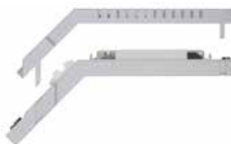
Dimensions in mm